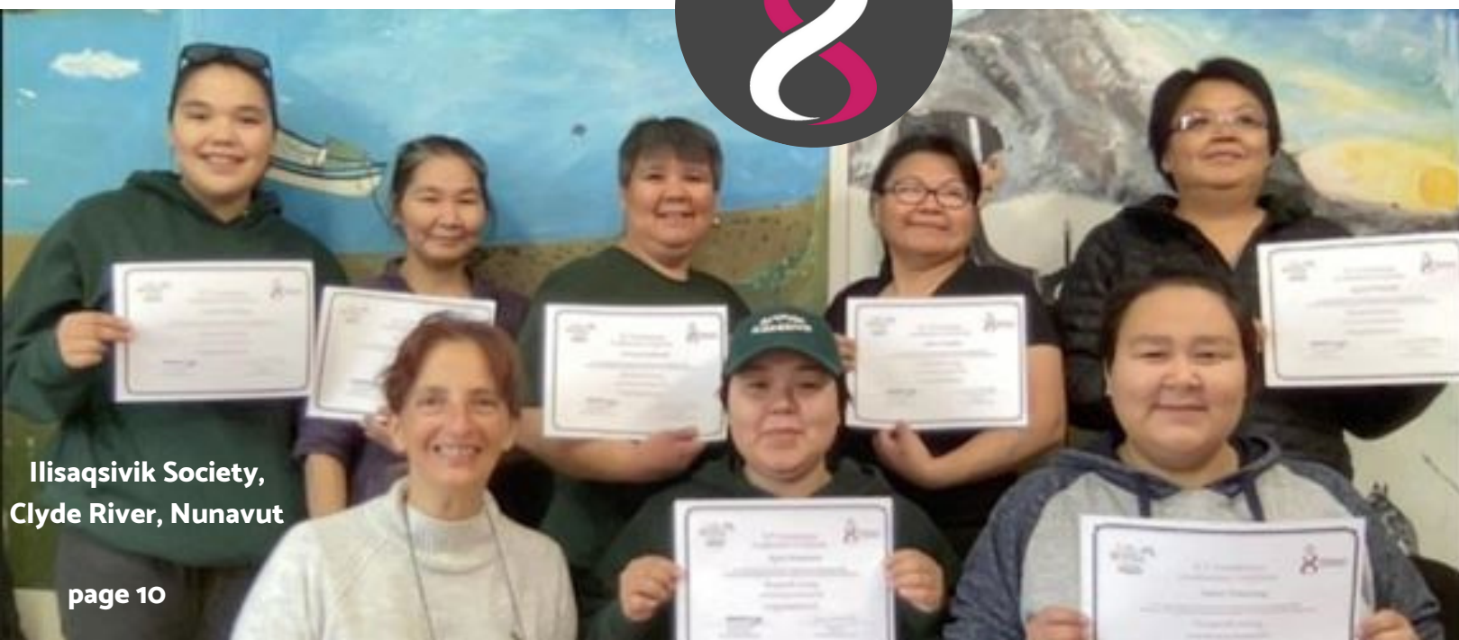
Ilisaqsivik Society, Clyde River, Nunavut