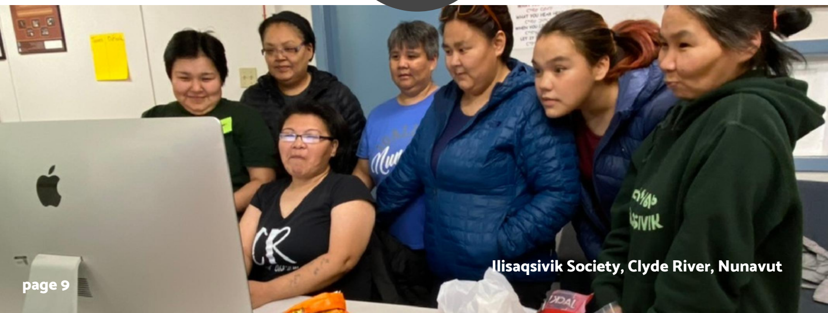
Ilisaqsivik Society, Clyde River, Nunavut